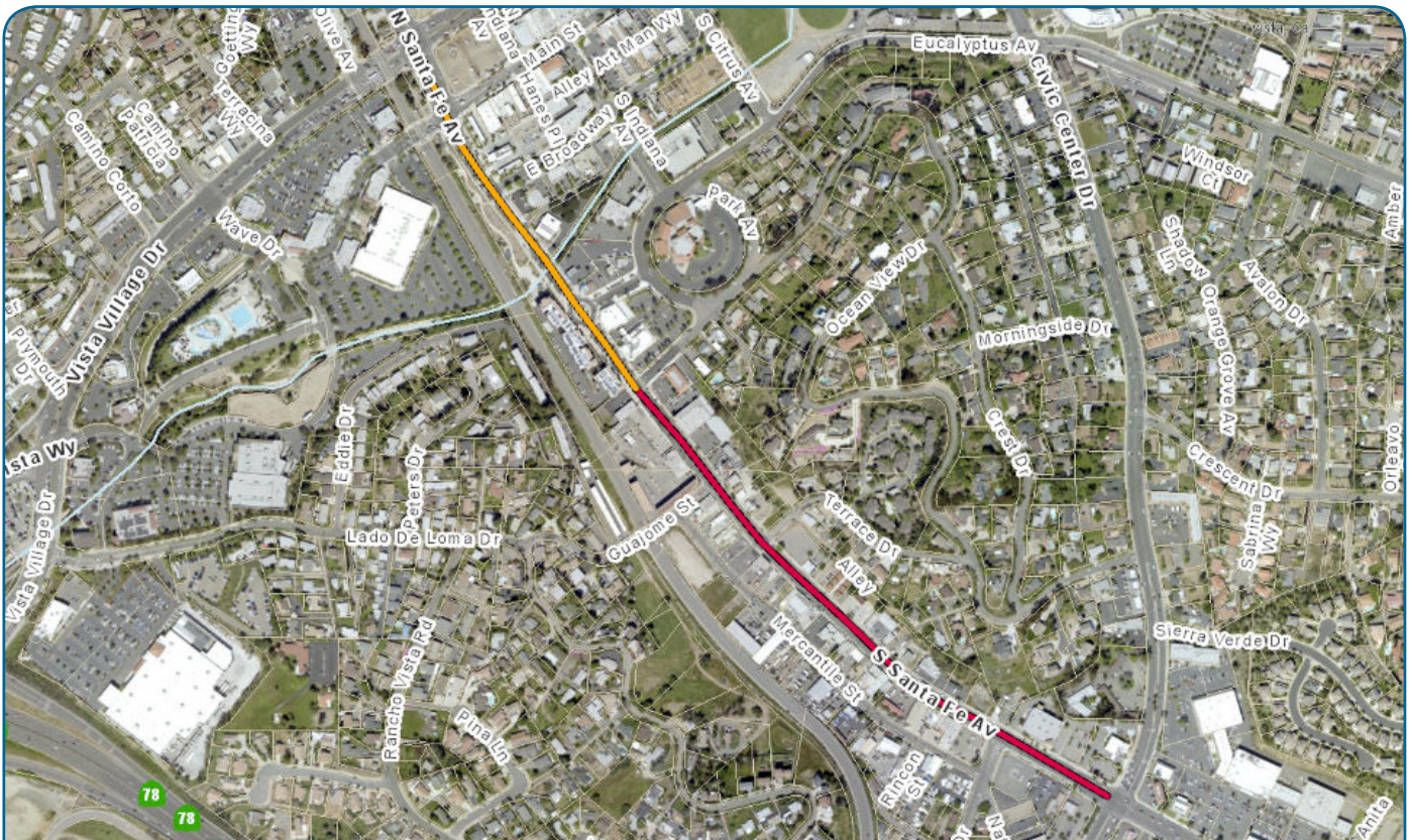
Paseo Santa Fe Improvements, CIP 8291

underground from Oceanview Drive to Civic Center Drive; installing new sewer and water pipelines for customers; and constructing a new roundabout at Guajome Street. The project will also include the installation of storm drain facilities on the east side of S. Santa Fe Avenue from Oceanview to Civic Center Drive. During the final portion of the construction work, new wider sidewalks, streetlights, and landscaping will be installed.