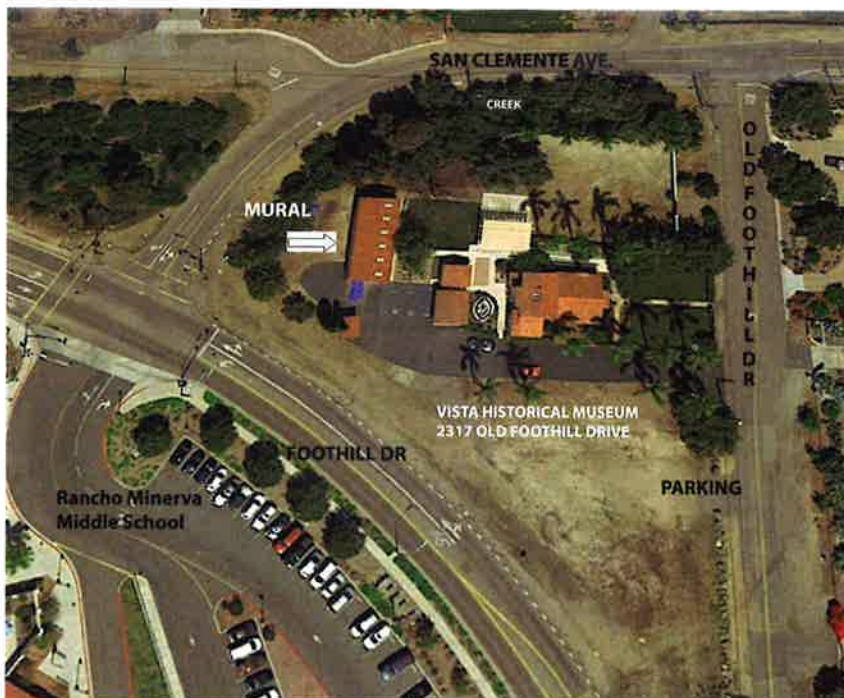
The arrow shows where on the site the mural will be located