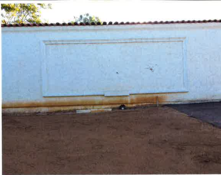
Wall frame where the mural will be located

The mural will be placed on the westerly side of the large storage building in a frame that was constructed along with the building. The interior dimensions of the frame are 22 feet 7 inches wide by 7 feet 7 inches high. The frame itself is 8 inches wide. On the bottom center of the frame is a place for the title of the artwork that is 4 feet wide 10 inches high and 6 inches deep.