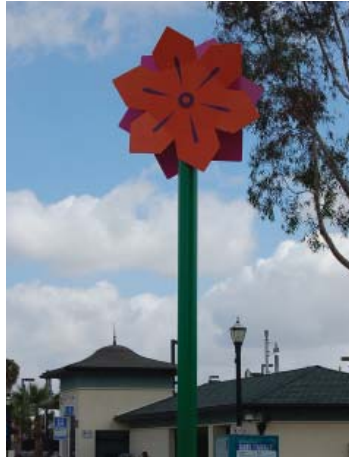
Flower Pinwheel by Carol Beth Rodriguez $1,500