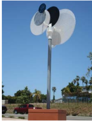
Cloud Formation by Josh Bowman $15,000