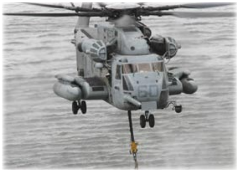
Paradise Fire - Strike Team 6418A