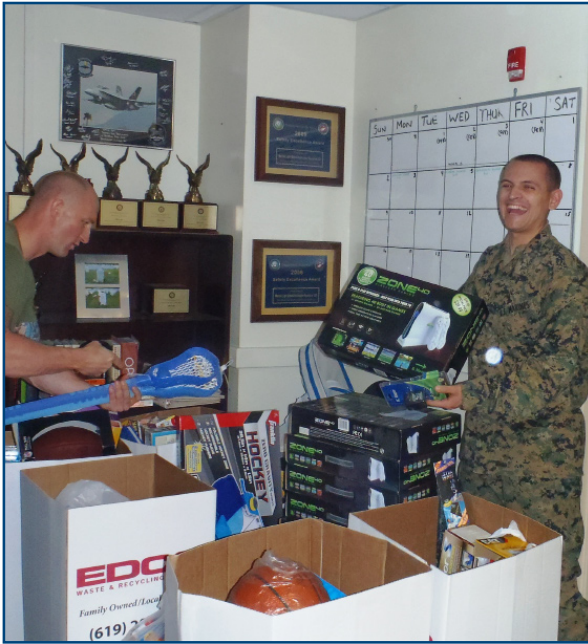
Marines pick up donated toys for their Unit's children at Christmas.